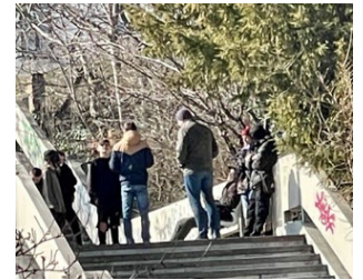
Slovakia Street Ministry

Students in that Forum represent six countries, including Spain, Morocco, Brazil, and Costa Rica, as well as the Roma people group.