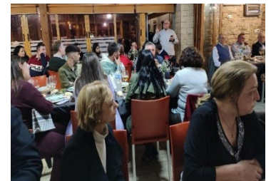
Jerez Married Couples Dinner

Another 60 people attended a Refugee Outreach evangelical event held just outside Jerez. Most of the refugees came from Ukraine but there were others who came from Venezuela, Peru, Colombia, and Nigeria. It was a very encouraging time as the Gospel message was translated into three languages. A young couple from Venezuela travelled thousands of miles, ending up at this 'picnic,' hearing the Gospel and accepting Christ into their hearts . An amazing God indeed!